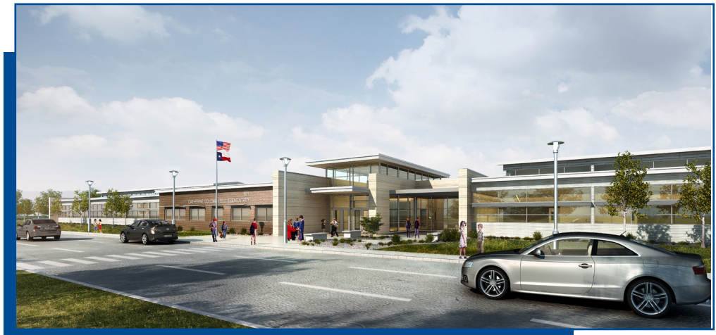
Bell Elementary Opening Fall 2016