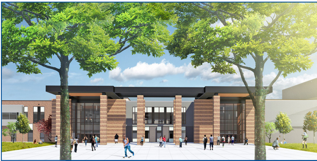
Braswell High School Opening Fall 2016